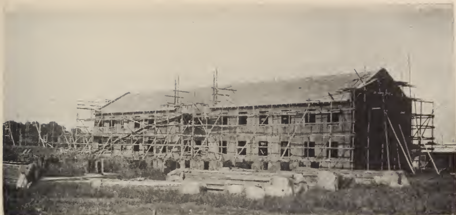
EAST DORMITORY, SAINT PAUL'S COLLEGE